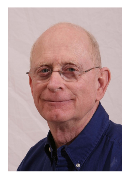
Bread from Heaven

Moses had a long, hot, windy, and dusty walk after crossing the Red Sea and going through the wilderness. No corn would grow in the wilderness and without corn, there would be no bread. Without bread, the people of God could not live.